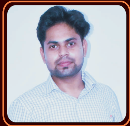
Principal IIMS & Indian Hospital, Ayodhya

We feel proud in welcoming you to IIMS & INDIAN HOSPITAL which has been established successfully over the past 17 years. Our institution is committed to provide and ensure high quality Nursing care education at Ayodhya. The richness of value added services in our campus and hospital which includes, all the department of patients with well-equipped facilities and advanced treatment modalities for students to learn the procedure in hands on training and positive emerging skills in their excellent profession. Effect made to modernize campus with new technical tool and simulation training in teaching method by highly qualified professors and lecturers that increasing students expectations to deliver the efficient content and more competent in their finest experiences towards clinical research and artificial intelligent. We are conscious of the challenging needs of society and patient care, hence we shall emphasize on imparting education and training to our students beyond the prescribed Indian Nursing Council syllabus to make them responsible and disciplined citizens to serve the people. I am glad to extend my open invitation to all those who are interested to study in our esteemed educational institution that shall be enable them to crystallize their dreams and potentials endeavor success in Nursing profession and their career in future.