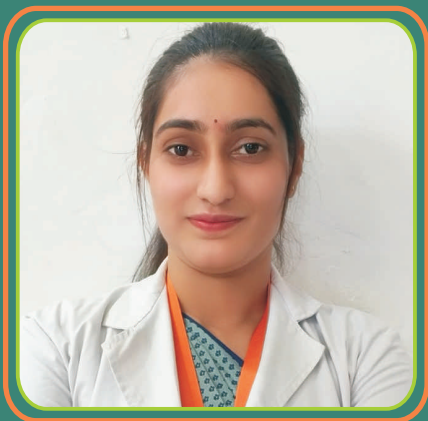
Vice Principal IIMS & Indian Hospital, Ayodhya

I warmly welcome all students to the IIMS family. Our institution is dedicated to fulfilling its mission of providing quality education and healthcare services, growing stronger with each achievement. At IIMS & INDIAN HOSPITAL, we embrace the holistic principles of hospital alongside modern advancements, fostering an environment of learning, innovation, and cultural exchange. Hospital, as the science of life, holds the wisdom of ancient traditions and practices that promote holistic well-being.